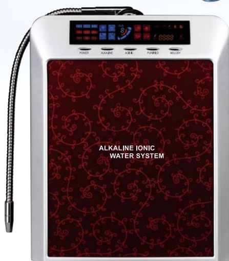
AQUARIUS Model : JP108