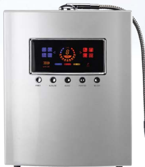
ORION Model : JP109

Automation controlled by advanced Micom circuit. Reduced mineral deposits using DARC system. Alarm message in case of low flux. Alarm message and ionization disabled during hot water inflow. Exact calculation of filter durability with Flux control. Extended range of pH selection and control. Filtration of diverse pollutants and microorganisms using high-quality filter. Calcium may be added through an exterior opening, extending the range of pH selection. (optional 0.01M hollow filter membrane) Flux control and inbuilt on-off valve, making exterior valve unnecessary Automatic flow reversal system. Elegant design. Silver coated active carbon filtration. Easy Filter Replacement. Under sink installation possible using under sink conversion kit.